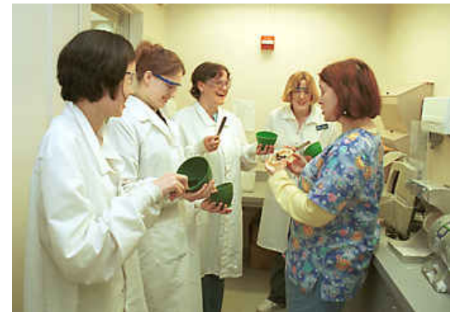
Students studying health care get some hands-on experience.

For more than eight years the Clearinghouse Network served as the communication liaison between Whatcom County businesses and partner schools. In 2004 the program adopted the new name Whatcom Community Connections along with expanded services and a new website. If you have worked with the Clearinghouse Network in the past, we hope you will continue to support this valuable program!